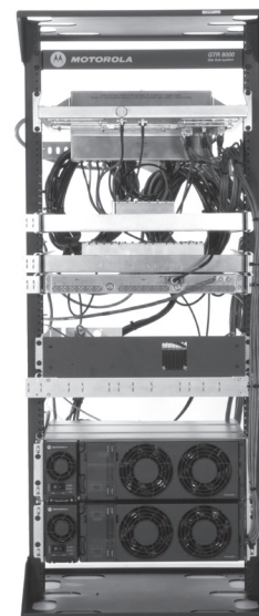
GTR 8000 Site Subsystem

Information Assurance capabilities are standard with G-series equipment and can be configured or disabled depending on your specific system maintenance and security requirements. G-series products provide the necessary boundary defense capabilities required in mission critical infrastructure today including local user accounts and password controls, user privilege model support (two levels), local and remote access services controls, secure shell services support, SNMPv3, central authentication, general operating system and network services hardening, and device test services controls.